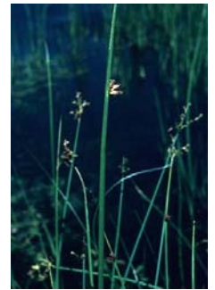
Robert W Freckmann

Grows in water up to 6 ft deep; prefers soft substrates; does not withstand heavy wave action. Provides food for waterfowl, marsh birds, upland birds. Provides habitat for fish and invertebrates and nesting material for waterfowl and marsh birds. Mature height up to 10ft.