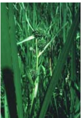
Robert W. Freckmann

Can be found on wetlands, lake and stream edges. Provides food for waterfowl and other wildlife. Exhibits showy 2 ½ - 3" lavender - blue flowers from May to July.