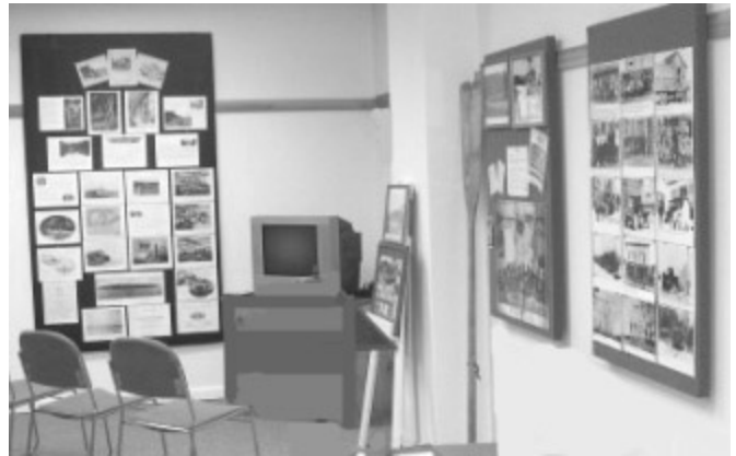
Some of the viewing and display areas at the Inland Water Route Historical Society are shown here.

Greg would love to talk about what is required for the lake monitor position; please give him a call at 548-2664 to find out what joys await you in this important and fascinating position.